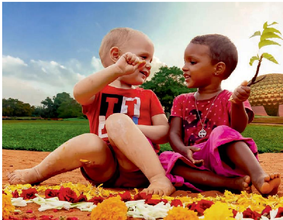
Right Bottom. Kids playing at Matrimandir.