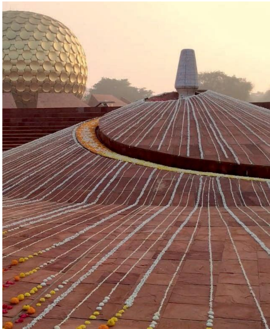
Right Bottom. Flower decoration at Amphitheatre, on Auroville Day.