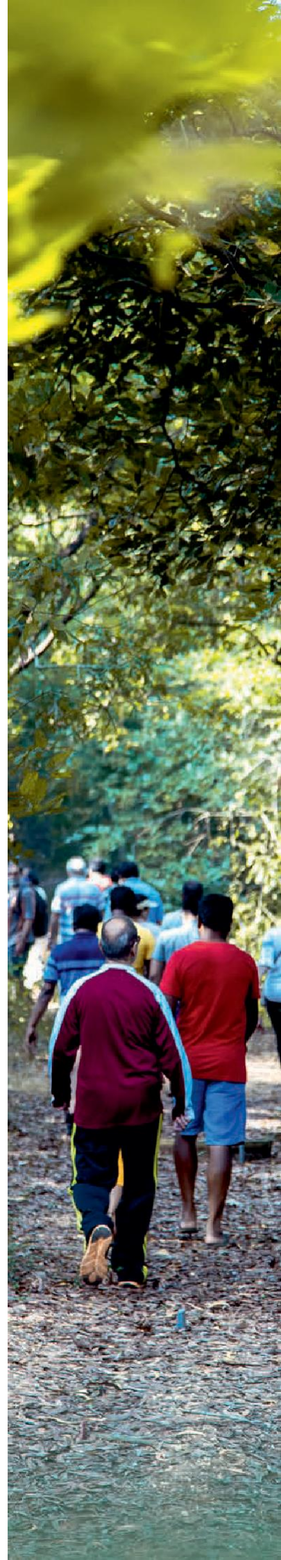
Right. Residents participating in the Crown Walk, July 2021 Left. Galaxy Plan denoting four crucial parks of Auroville.

Developing a security strategy for parks and corridors can help to ensure that the Green Network is safe and secure for all members of the community. This can involve identifying potential security risks and developing strategies to mitigate them, such as installing park lights and enhancing security measures.