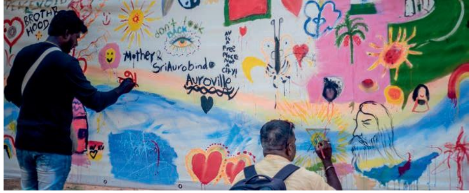
Right Top. Auroville residents expressing themselves with public art, during Auroville Festival.

Auroville's recent asset reset is a bold move aimed at shaking up the City's power structures and creating a more equitable and collaborative model of governance. By resetting the assets, the City is taking a step towards breaking free from the feudal system of control that has been in place for too long. The reset is a necessary move to ensure that all members of the City have an equal say in the decision-making processes and to promote transparency and accountability.